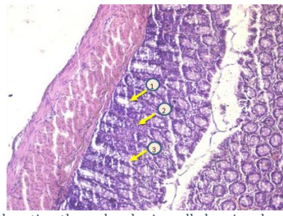
Figure 3: Histological section through colonic wall showing drug (sulfasalazine) effects after 7 days treatment in which there is evidence of mucosal regeneration and glandular formation (1); mild inflammation (2); and goblet cells regeneration (3); 10X; H and E stain.

Table 2: Biochemical parameters and colonic homogenates of different groups of the study.