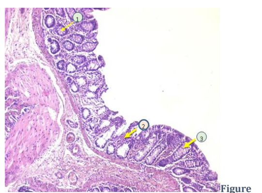
Histological section through colonic wall showing drug (MFX) effects after 7 days treatment in which there is evidence of mucosal regeneration and glandular formation (1); mild inflammation (2); and goblet cells regeneration (3); 10X; H and E stain.

Figure 3: Histological section through colonic wall showing drug (sulfasalazine) effects after 7 days treatment in which there is evidence of mucosal regeneration and glandular formation (1); mild inflammation (2); and goblet cells regeneration (3); 10X; H and E stain.