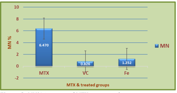
Figure 2: MN% in group of MTX versus to the treatment groups, p-value <0.05.

B: Intracellular micronucleated polychromatic erythrocytes (MNPCEs), X100.