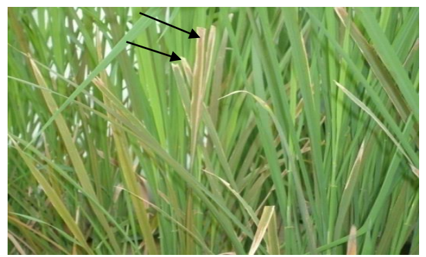
Figure 3: Confirmation through pathogenicity and Koch's postulates. Arrows indicate the lesion moving downward from inoculated tip of leaf

Artificially inoculated plants showed symptoms of disease in the glass house (Fig. 3).