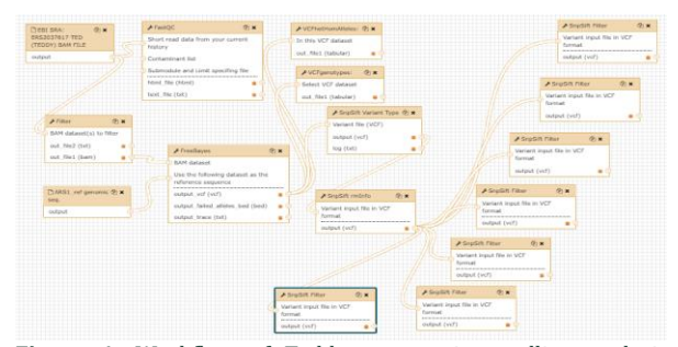
Figure 4: Workflow of Teddy goat variant calling analysis constructed on Galaxy. Tools are mentioned in boxes along with input and output files which are connected with wires.

SnpSift toolkit allows filtering and manipulating vcf files. It identifies candidate phenotype-relevant variants and envisages its effect on genes [10]. Filtering variants using arbitrary expressions and annotation was executed using this tool on the obtained vcf file generated by FreeBayes tool. Complete workflow of different Galaxy tools with input and output files used in this study on pooled-Seq data are shown in (Figure 4).