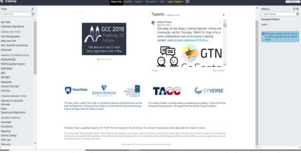
Figure 3: Graphical user interface (GUI) of web-based Galaxy platform.

Galaxy <u>https://usegalaxy.org/</u> is web-based open source platform meant for analyzing data, making workflows, its visualizing and sharing data, thus allowing scientists to do computation on their datasets anywhere anytime [7]. All features of galaxy platform are freely available by registering and logging-in. Galaxy presents all-in-one platform aiding researchers to do data analysis spontaneously and in a simplified way with hundreds of bioinformatics tools. In order to get raw data, galaxy could be connected to various genome browsers and databases (Figure 3), which shows interface of galaxy with tools list in its left panel, history in right panel and central panel displaying home page.