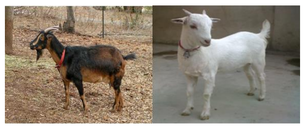
Figure 2: True representatives of both breeds Teddy (right) San Clemente (left).