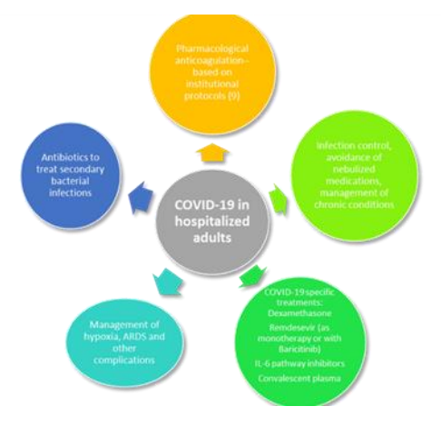
Figure 1: Approach for managing COVID-19 in hospitalized adults

The objective of the current review is to summarize the role of antiviral medications in COVID-19, with special focus on mild and moderately symptomatic disease; the focus will be on reviewing antiviral treatments that can be used for prevention of disease progression as well as limitation of disease transmission.